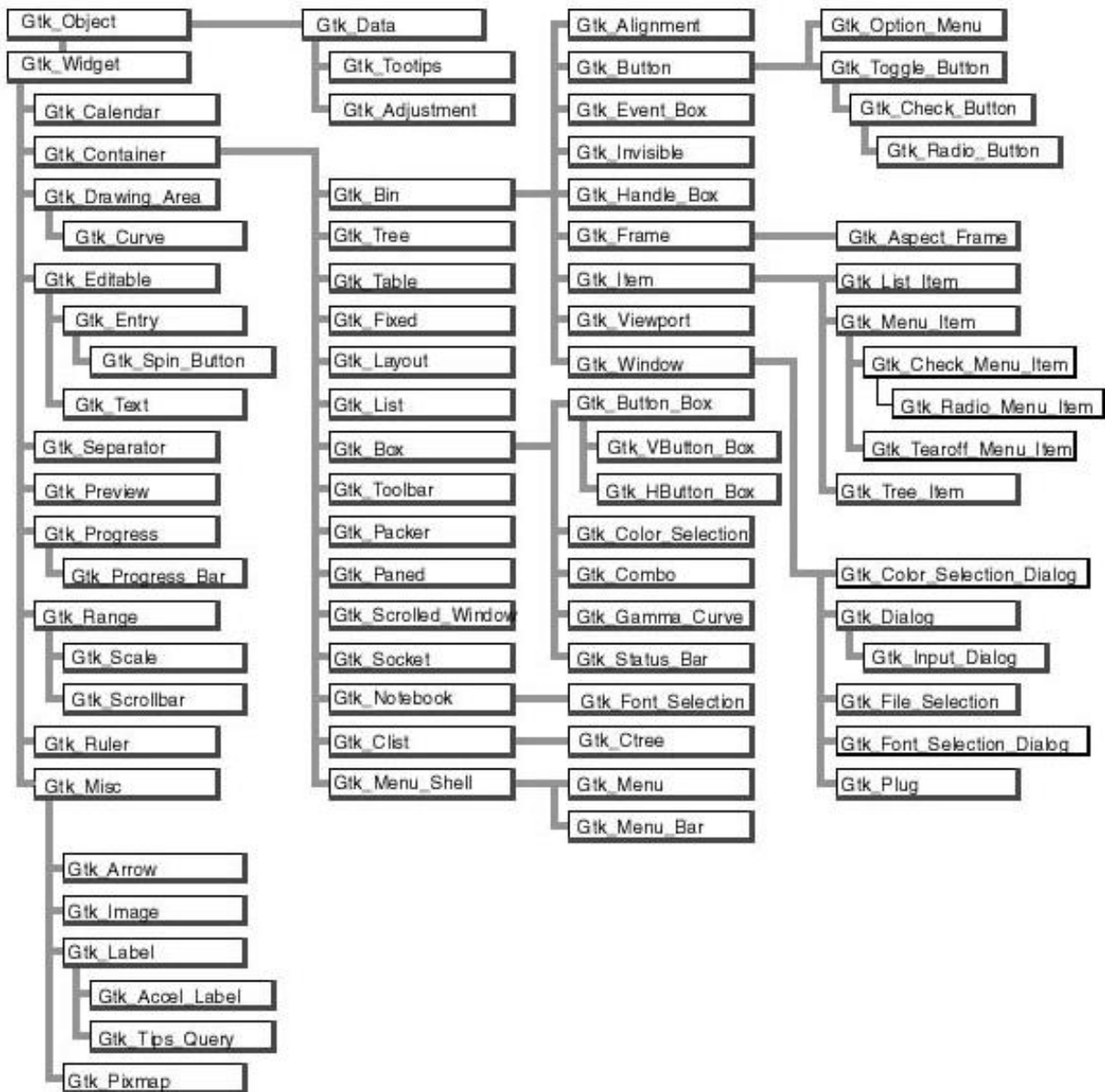
Figure 2.1: Widgets Hierarchy

It is important to be familiar with this hierarchy. It is then easier to know how to build and organize your windows. Most widgets are demonstrated in the testgtk/ directory in the GtkAda distribution.